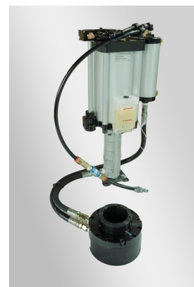
Booster (Pressure transformer pneumatic-hydraulic)

Various tool interfaces, internal and external cooling lubricant feeds for tool cooling or safety-relevant digital or analog tool clamping condition queries are optionally available. Speed monitoring via incremental shaft encoder and the thermal motor protection sensor are mandatory.